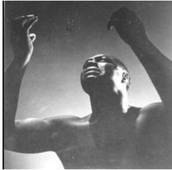
Canada Lee in Native Son

Under FDR's Federal Theater Project, he played Banquo in Orson Welles' black Mac-