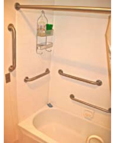
Extra grab bars installed in bathtub increase safety.