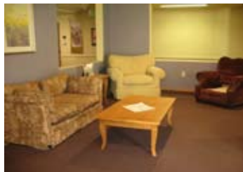
Meditation Lobby: Chairs and cushions keep disappearing.

Certainly someone has been removing the extra chairs