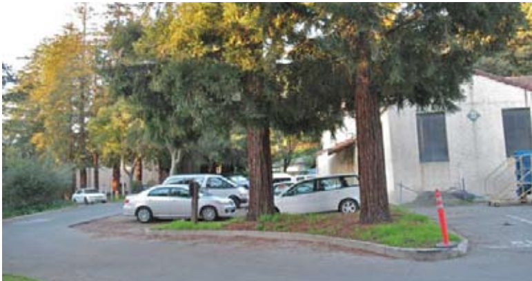
This is what we call the "East-side dirt parking lot." Parking is one of the big issues at Redwood Gardens.