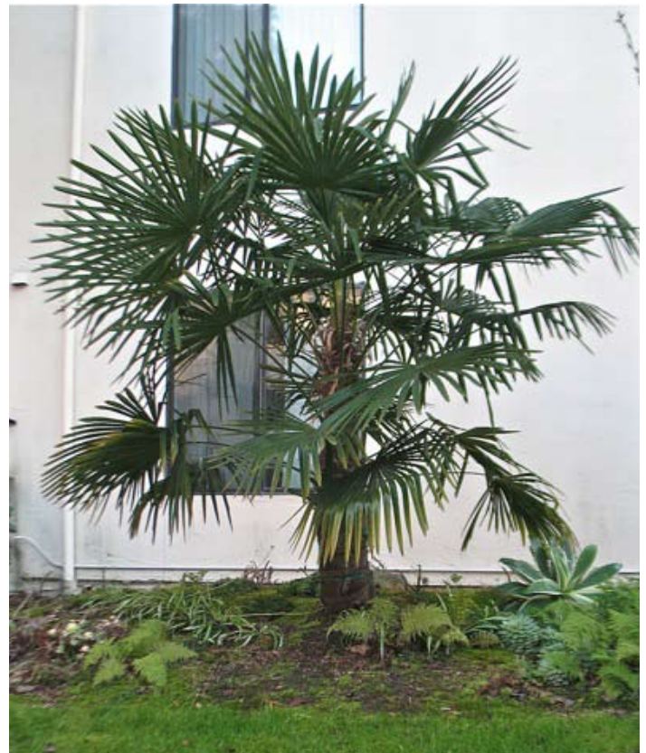
Windmill Palm on the south-central side of the courtyard.