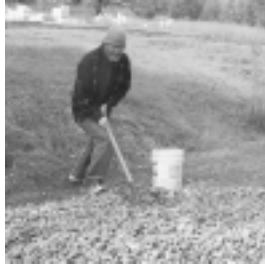
At the rock pile

Acorn will make more signs for people to slow down. We need a couple of speed bumps put in.