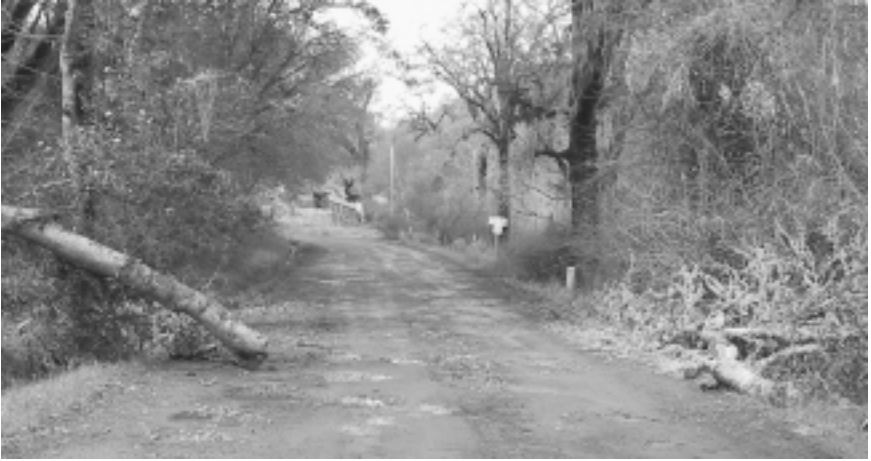
Tree down across road. Acorn was first on the scene with a chain saw and cleared it with Phil's help.